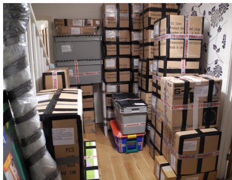
Warehouse in our UK home