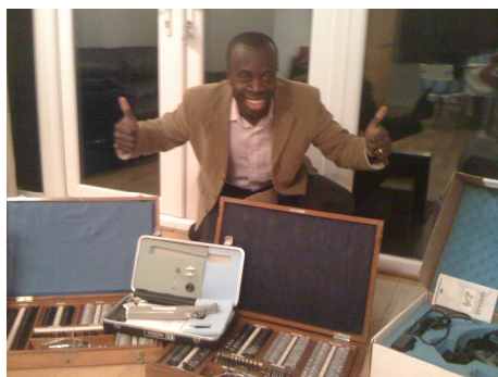
Donated eye equipment

OPERATION MEDICAL SUPPLIES & SHIPPING: We are purchasing and shipping supplies and equipment from 12 companies in 8 countries! We had to list every single item that we are packing in French. The tax exoneration process demands 19 pieces of documentation for each shipment. Please pray for the process to be free from corruption and inefficiencies. Otherwise, we may have to pay an additional USD17, 000 in taxes, and several hundred dollars for each day that the shipment is parked in the port if clearance by customs is delayed.