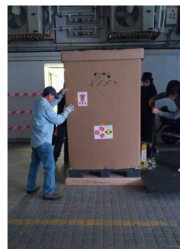
Operation Operating Microscope

OPERATION OPERATING MICROSCOPE: This essential piece of equipment has been generously donated by a hospital in Hong Kong. When new, it costs USD40, 000. It took a whole day for a whole troop of amazing volunteers to pack it. We thank God that after many days, we have finally found a way to ship such a bulky and heavy item from HK to the capital of Congo. However, it is very fragile. Please pray as we look for a way to commission a plane to get it from the capital to our hospital and for it to arrive in working condition!