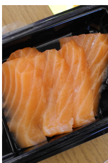
The Last Sashimi